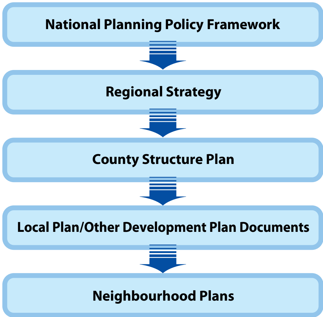
Figure 1 - Chain of Conformity